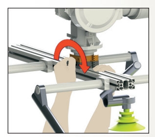
Tighten knob to secure. Unscrew knob to unlock.